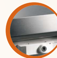
STAINLESS STEEL LID AVAILABLE*