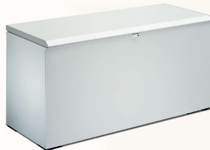
F 68 Chest Freezer